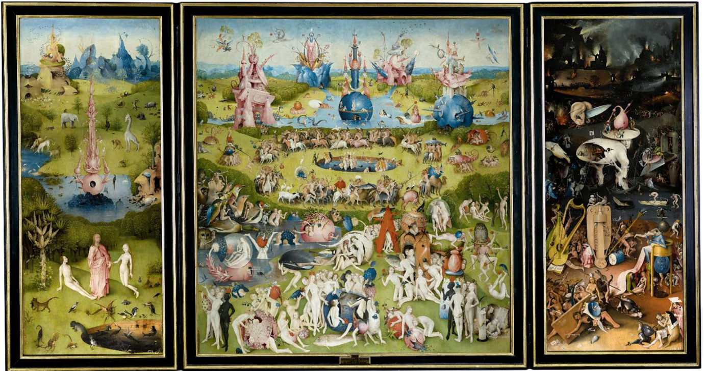
Fig. 5. The Garden of Earthly Delights serves as a didactic warning on the perils of life's temptations, which applies as much to shirking on vaccination, as it does to abandoning vigilance in times of epidemics. From left to right, we first have the meeting of Adam and Eve, followed by a socially balanced state of wellbeing in the center, and ending with a hellscape that portrays the torments of damnation that may result due to excesses in modern human societies.

To conclude, we note that this special issue is also to feature future research. In order to avoid delays that are sometimes associated with waiting for a special issue to become complete before it is published, we have adopted an alternative approach at Chaos, Solitons & Fractals. The special issue will be a virtual one, updated continuously from the publication of this introduction onwards, meaning that new papers will be published immediately after acceptance. The down side of this approach is that we cannot feature the traditional brief summaries of each individual work that will be published, but we hope that this is more than made up for by the immediate availability of the latest research. Please stay tuned, and consider contributing to “Vaccination and epidemics in networked populations”.