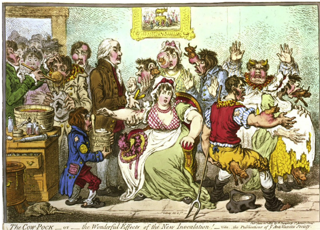
Fig. 2. Satirical cartoon by James Gillray capturing public fears of the smallpox vaccine in the 18th century, the first “vaccine scare”. Edward Jenner stands in the middle, administering the smallpox vaccine. Vaccinated persons grow cow parts out of various parts of their bodies because the smallpox vaccine of the time was based on the virus that causes cowpox, hence producing the fear among some that the vaccine would turn humans into cow-like hybrids. A painting of the Worshippers of the Golden Calf hangs in the background.

in substantial detail [41,42]. In addition to these different vaccination strategies, network structure also plays an important role in the transmission routes and infection levels [2,9–12]. For example, in community networks, bridge nodes, connecting different communities, provide pathways for disease propagation, so that how to identify and immunize these nodes thus decides the final success rate [43,44].