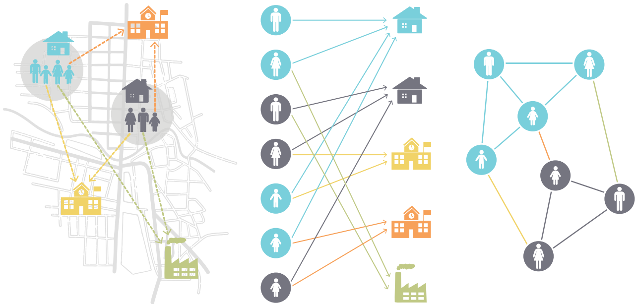
Fig. 4. Network epidemiology. At the macroscopic level (left), a synthetic population and the movements of its members can be constructed from census and demographic data. A bipartite network associating individuals to locations can be derived based on data from the synthetic population (middle). Lastly, the unipartite projection of the bipartite network provides a contact network (right), upon which an agent-based model can unfold. This figure is reproduced with permission from [1].

is presented in Fig. 4, where based on census and demographic data as input the network of contacts is constructed from an intermediate bipartite network associating individuals to locations. The GLocal Epidemic and Mobility (GLEAM) model [82] is a particular example that integrates census and mobility data in a fully stochastic metapopulation network model that allows for the detailed simulation of the spread of influenza-like illnesses around the globe.